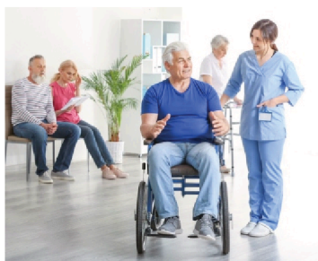
Chronic Disease Agency